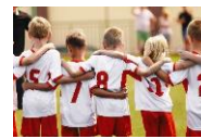
Insight competency frameworks