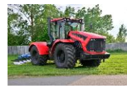
Developing your knowledge systems