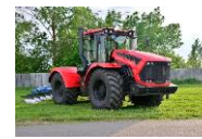
Developing your knowledge systems