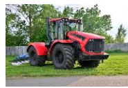
Developing your knowledge systems