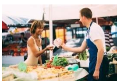
Commercial thinking for Insight 18 May & 21 Sep