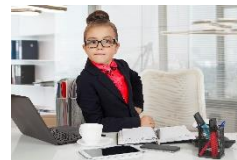
Communication planning workshop**