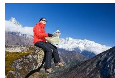
Insight positioning workshop