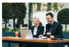
Mentoring for Insight leaders