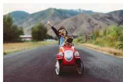
Insight transformation workshop