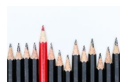
Advanced Insight benchmarking

All IMA team development is provided online