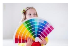
Visual communication for Insight 28 Jun, 19 Oct* & 2 Nov