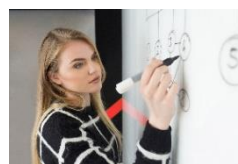
Consultancy & detective skills for Insight 24 May & 27 Sep