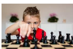
Insight strategy consultancy