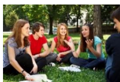
Introduction to corporate Insight 10 May & 15 Sep

These topics can also be booked for your Insight team, subject to availability