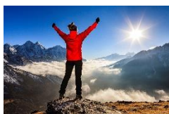
Value of Insight project