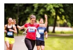
Aspiring Insight leaders 21 Jul & 30 Nov