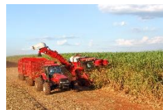
Knowledge farming workshop