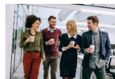
Influencing skills for Insight 7 Jun & 5 Oct