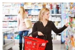
Behavioural economics for Insight 15 Jun & 11 Oct